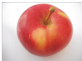
Summer Red- A high yielding variety with attractive colour