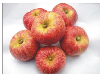
Apple No 1- A variety with attractive colour flavour and matures earlier