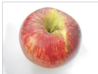
Star King Delicious- A high yielding variety with attractive colour